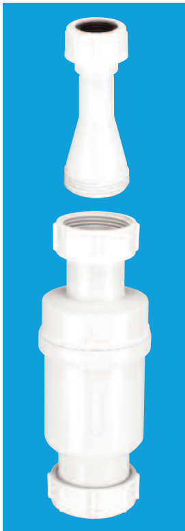
MacValve 1 1/4" BSP female inlet nut x 1 1/4" universal compression outlet including Tun Dish adaptor 1 1/4" BSP male thread x 22mm universal inlet

When MACVALVE-1 and MACVALVE-2 are installed horizontally the flow arrow must be in the uppermost position