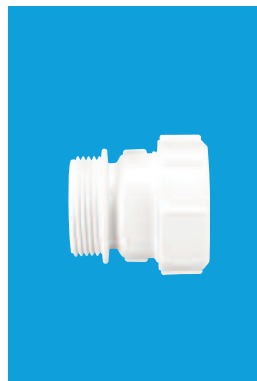
90° Bend 1 1/2" female inlet nut x 1 1/2" BSP male connector