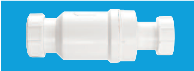
MacValve 1 1/4" BSP female inlet nut x 1 1/4" universal compression outlet