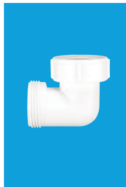
90° Bend 1 1/4" female inlet nut x 1 1/4" BSP male connector